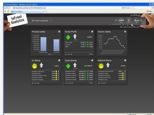
Profitbase InFront Analytics Dashboard in a Browser